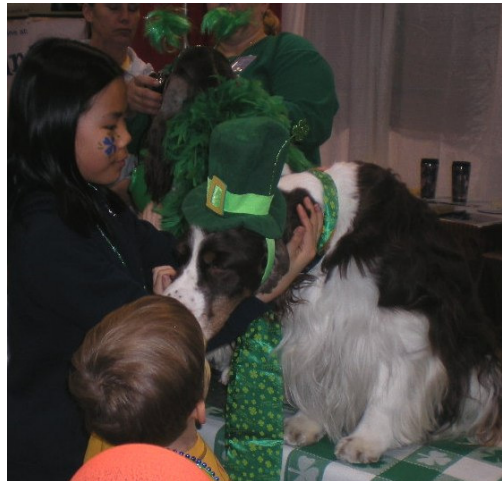
...and dispensing kisses