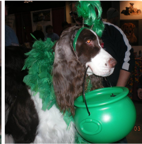
Who can say no to Page?