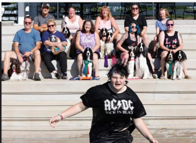
Having fun on dock diving day!