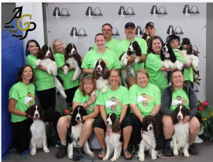
VinEwood Family at Nationals